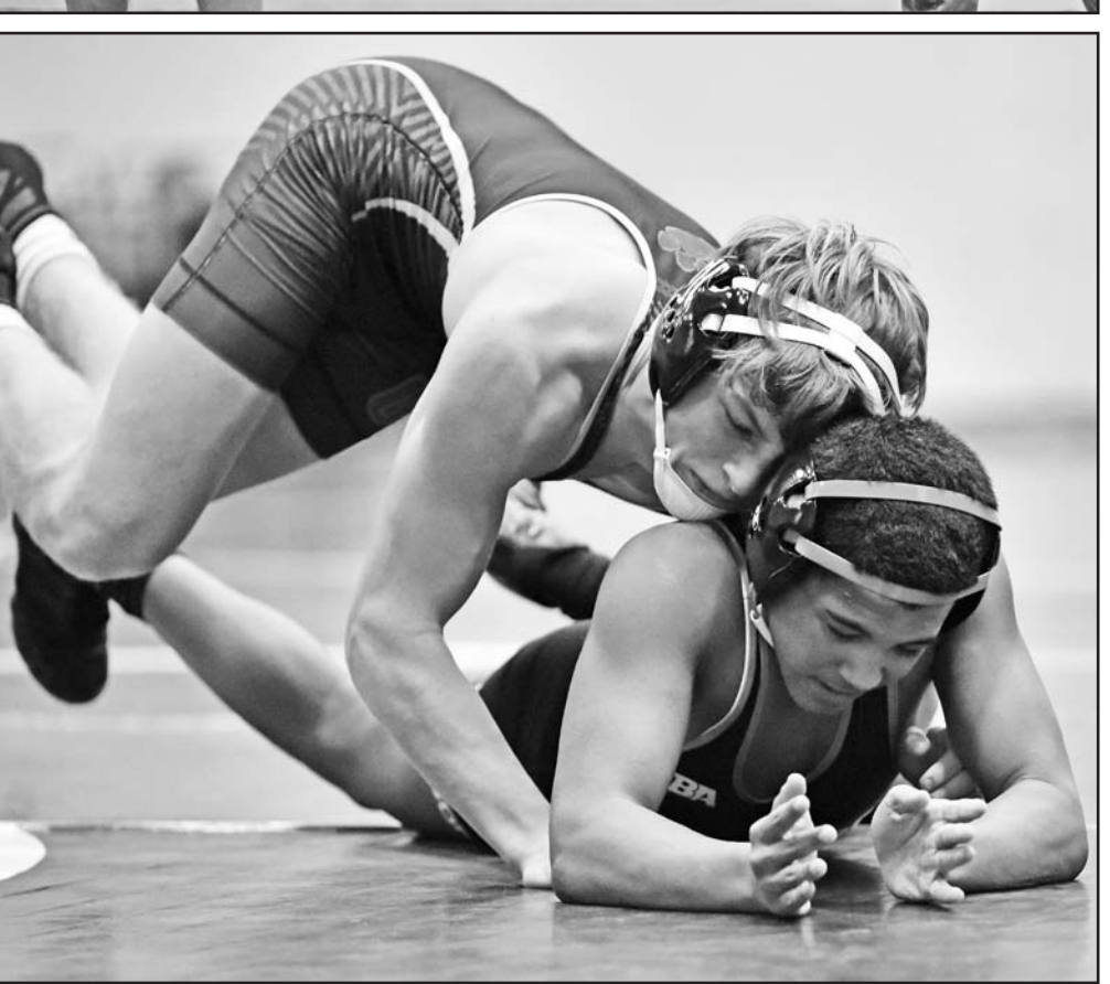
Union County takes on Jackson County in The Pit on Friday, Dec. 11.